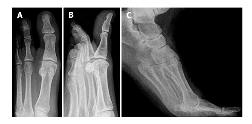
Figure 1 Radiographic images of a hallux rigidus grade 2. A: Dorso-plantar view; B: Oblique view; C: Stress radiographs in dorsiflexion revealing bony impingement.