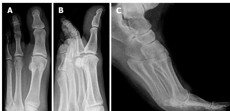
Figure 1 Radiographic images of a hallux rigidus grade 2. A: Dorso-plantar view; B: Oblique view; C: Stress radiographs in dorsiflexion revealing bony impingement.